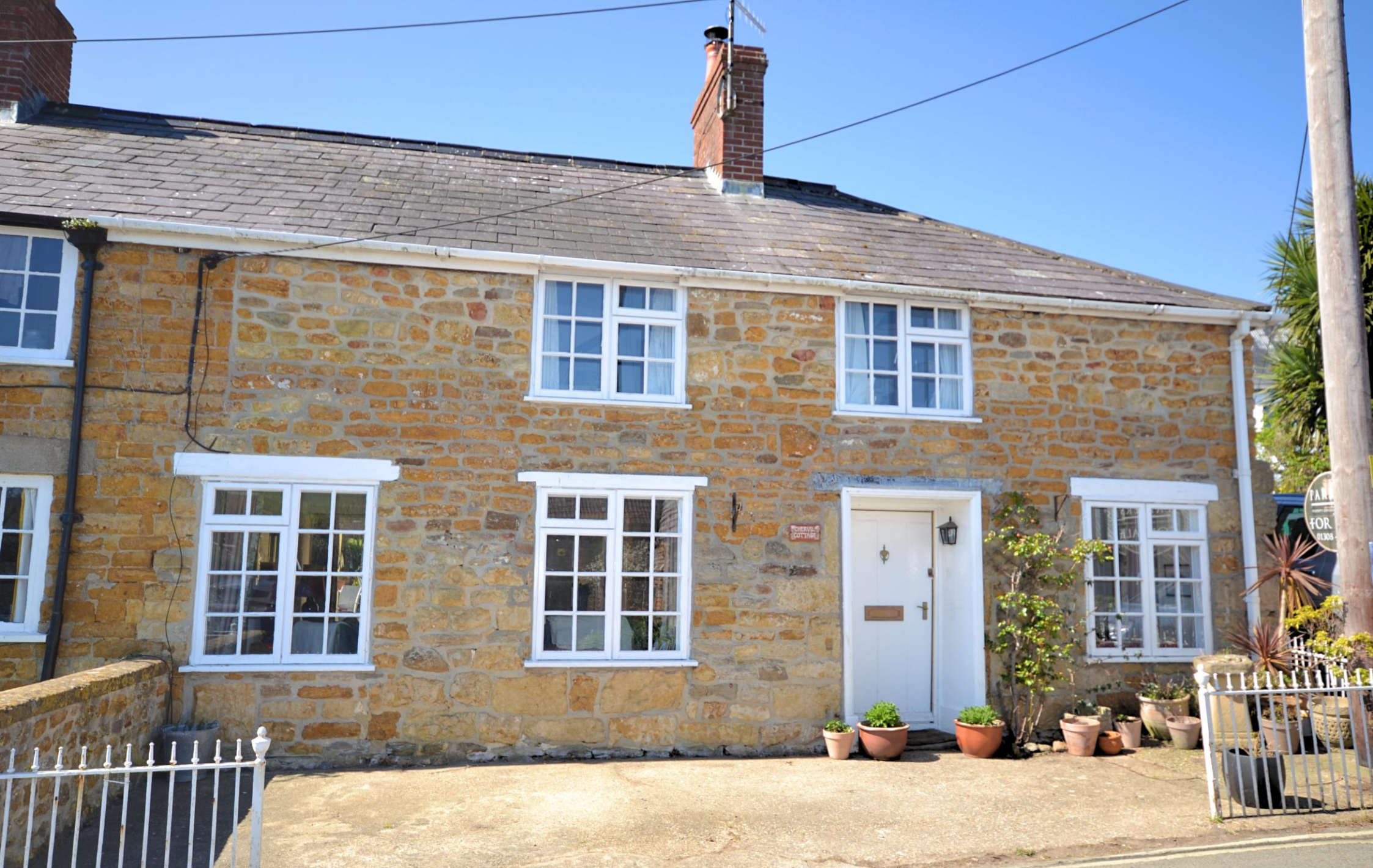
Chervil Cottage Chideock